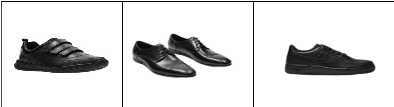
Photos of Shoes- Girls