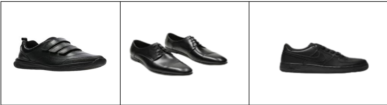
Photos of Shoes- Girls